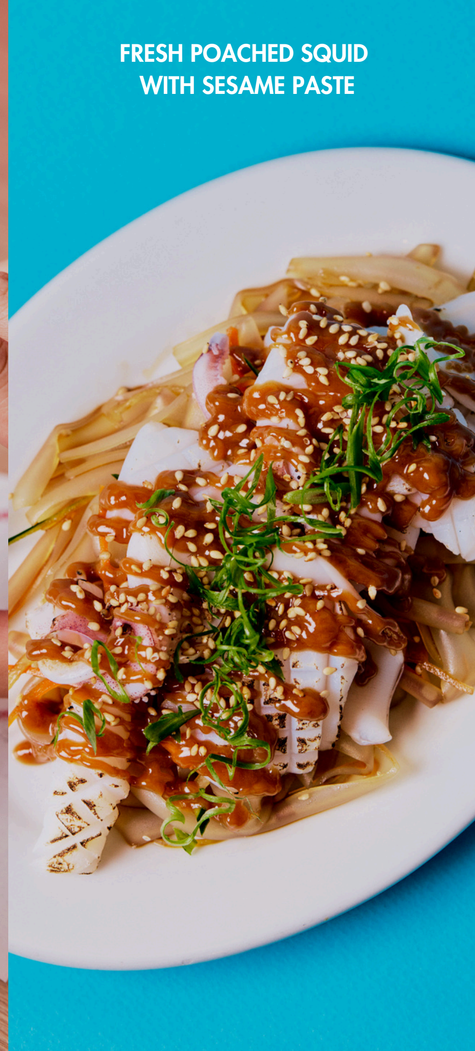
FRESH POACHED SQUID WITH SESAME PASTE