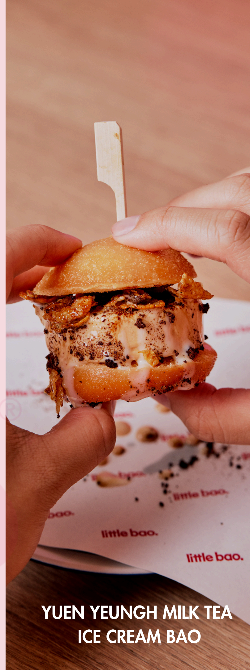
YUEN YEUNGH MILK TEA ICE CREAM BAO