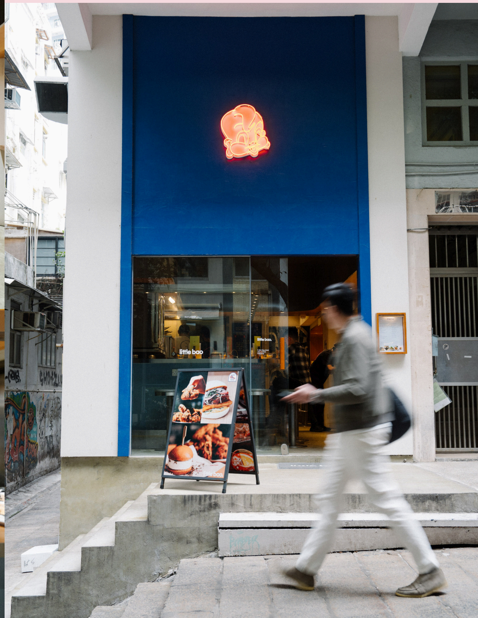
Little Bao Soho Central