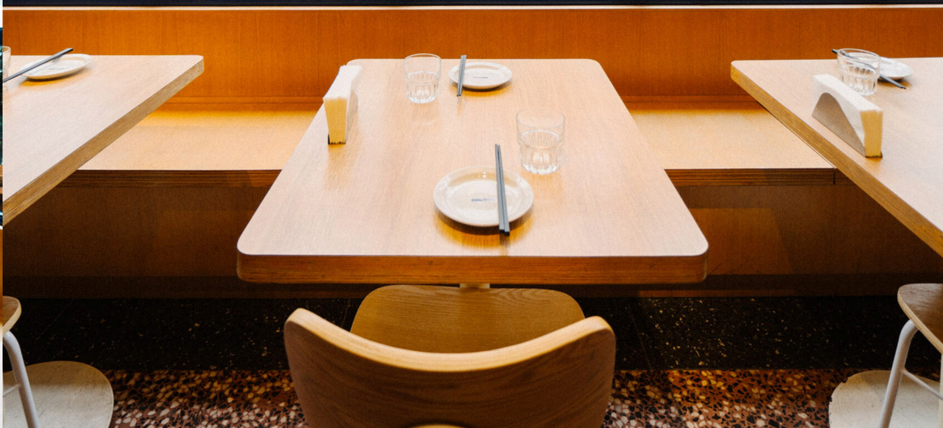
Little Bao Diner Causeway Bay