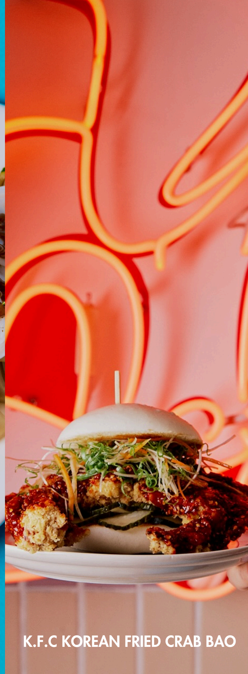
K.F.C KOREAN FRIED CRAB BAO