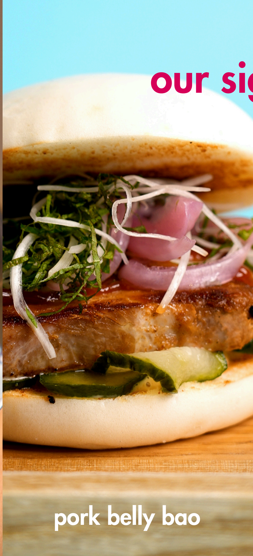
pork belly bao